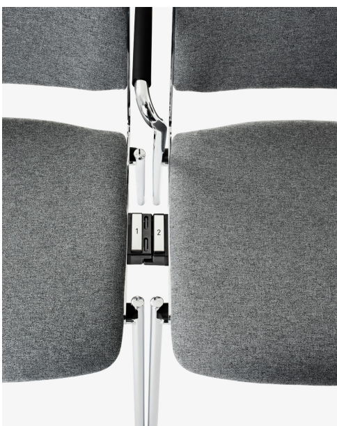
space and row number holder