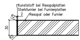
Table top R: 30 mm thick, MDF, surface coated in high-pressure laminate (HPL) or veneer according to BRUNE® collection. Underside: HPL white or beech veneer. Edges MDF, straight edges, 10 mm thick, beveled over 45 mm.

Table top C: 30 mm thick, multi-layer particle board, E1, coated in high pressure laminate (HPL) or veneer according to BRUNE® collection. Plate bottom side HPL white or beech veneer. ABS edging in connection with laminated top or veneer edging in combination with veneered table top. Corners rounded R 200 mm.